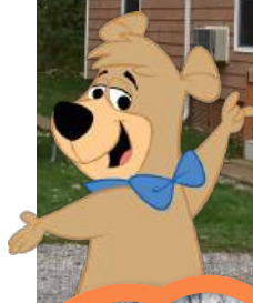
Cottages (small & large)